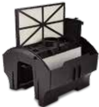
Filter removes easily from filter frame