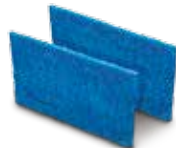
Optional Accessory: Spring Clean-Up Filter Element Model RCX70101