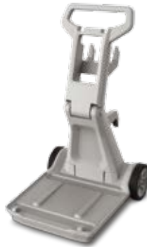
Universal Caddy Cart RC3400CC (Sold Separately with Model RC3431CU)