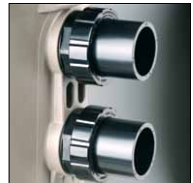
CPVC Union Connections