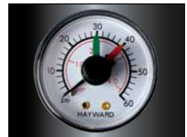
Pressure and Cleaning Gauge