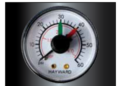
Pressure and Cleaning Gauge