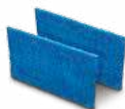
Optional Accessory: Spring Clean-Up Filter Element Model RCX70101