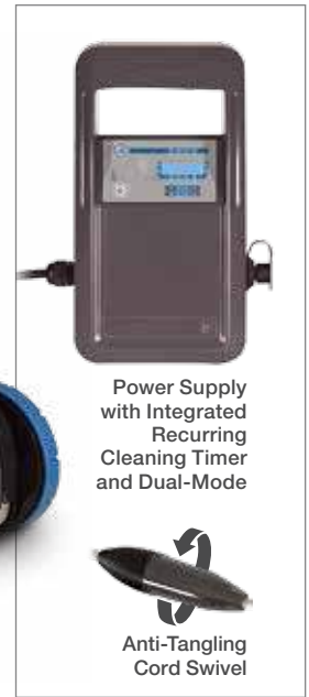
Power Supply with Integrated Recurring Cleaning Timer and Dual-Mode