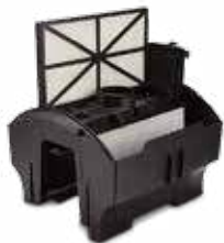
Filter removes easily from filter frame