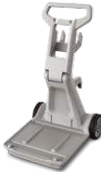
Universal Caddy Cart RC3400CC (Sold Separately with Model RC3431CU)