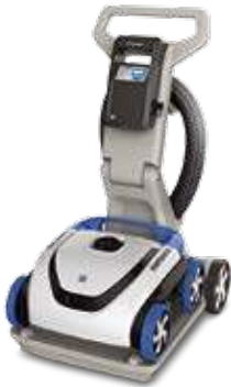
One Complete Cleaner Kit includes Caddy Cart (Model RC3431CUY)

AquaVac 500 RC3431CU (without caddy cart)